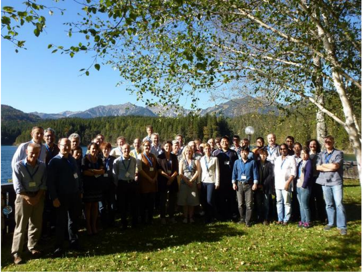
WGCM18 participants in front of the Eibsee