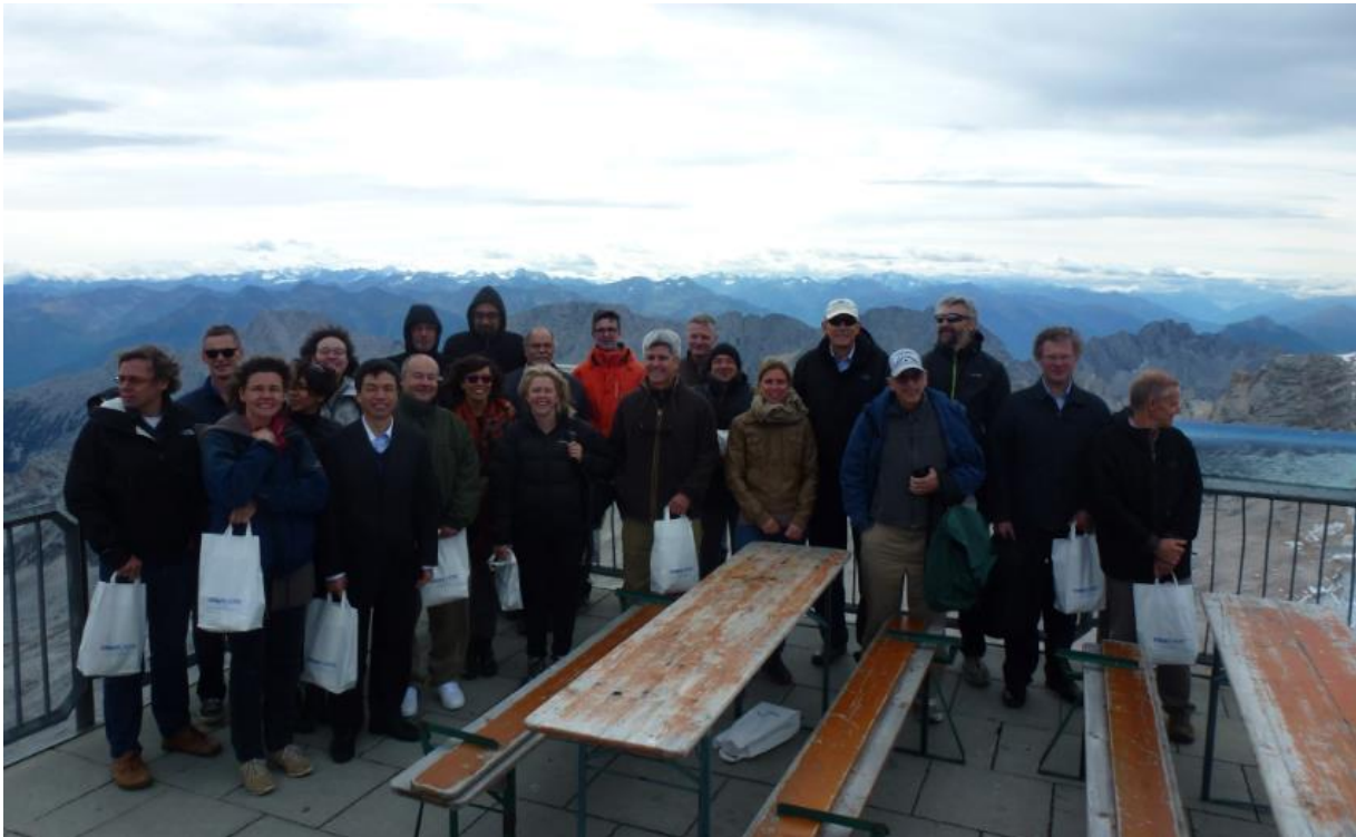
WGCM18 participants at the Zugspitze